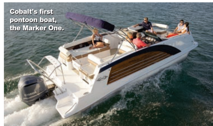
Cobalt’s first pontoon boat, the Marker One.